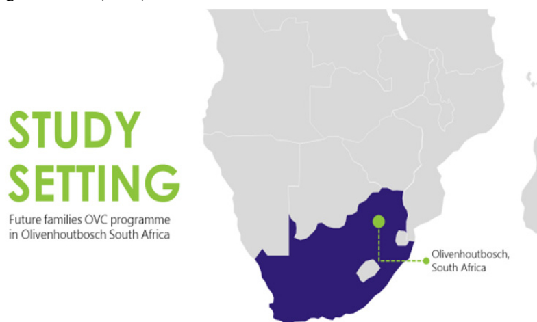
Figure 3. Map Study Setting: South Africa, Olivenhoutbosch

2014). Olieven is a research setting with high poverty rate according to Stat SA (2017) and HIV rate leading to high orphan hood according to Stat SA (2017).