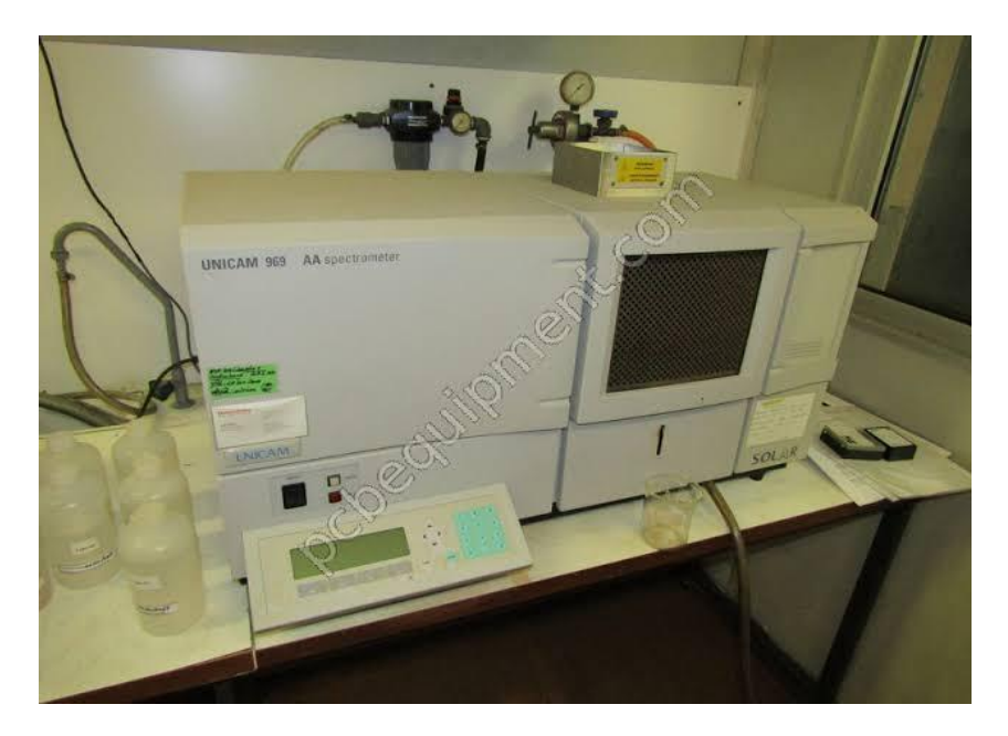
Fig. 2. UNICAM AA 919 atomic absorption spectrophotometer