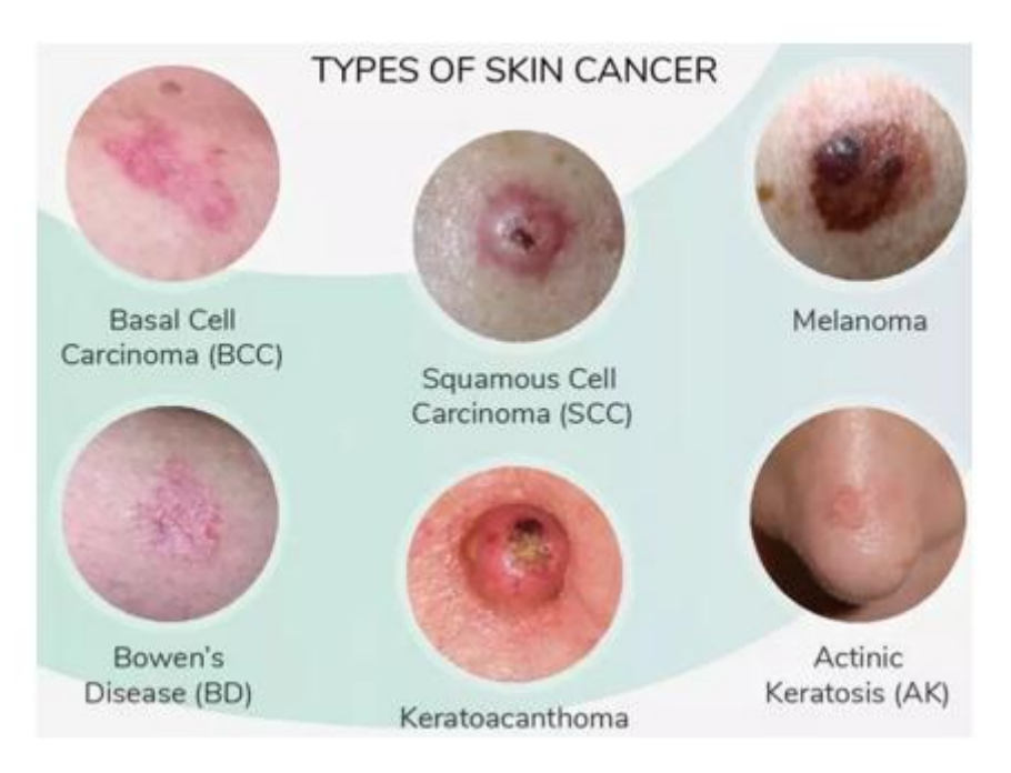
Fig. 1. Different type of skin cencer

On the other hand, there is proof that overfinding may have a section to play. Later investigations epidemiologic show that melanoma in situ, with a yearly frequency of 9.5%, involves a lopsidedly high rate of the general increment in MM frequency. From the perspective. dermatopathologic there contemplates proposing a present pattern towards renaming of earlier non-dangerous analyze as LL. Besides, in a populace-based examination corresponding to the number of skin biopsies and the occurrence of MM, the specialists noticed that there was an equal increment during a 15-year time span, recommending that the MM scourge may likewise be identified with expanded examination and number of biopsies.