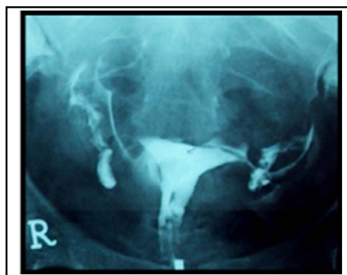
Fig.1: Normal HSG examination normal uterine cavity and bilateral fallopian tubes with normal free spillage of contrast on either side.

Unilateral tubal blockage was present in 15% and bilateral tubal blockage in 10% of patients. Bilateral hydrosalpinx was present in 10% of patients while