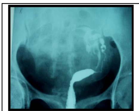
Fig.4: Unicornuate Uterus.

unilateral loculated spill was found in 5% of patients with infertility. Patients with uterine congenital anomalies were also evaluated and it was found that the frequency of bicornuate uterus was 4%, unicornuate uterus was 2% and uterine didelphys was 0.2% in the present series (Fig. 1-4).