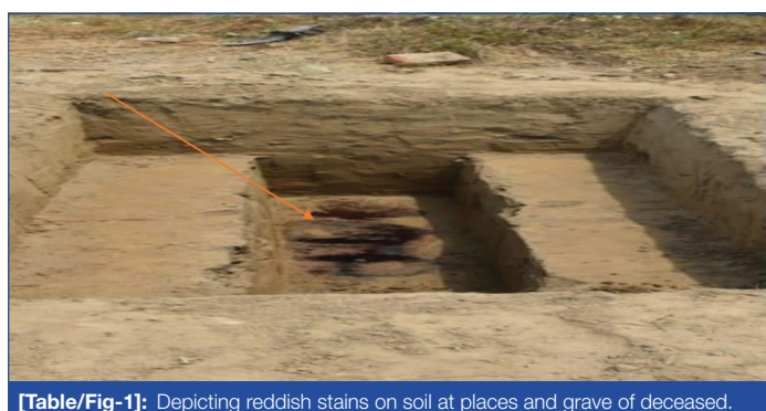
[Table/Fig-1]: Depicting reddish stains on soil at places and grave of deceased.

Upon opening the grave, it was three feet deep and the corpse was found wrapped in a white coloured cloth. This was extracted and sent to the Forensic Department for examination. The soil was soaked in reddish fluid at places [Table/Fig-1].