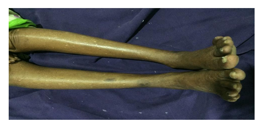
Fig. 3. A case of idiopathic guttate hypomelanosis