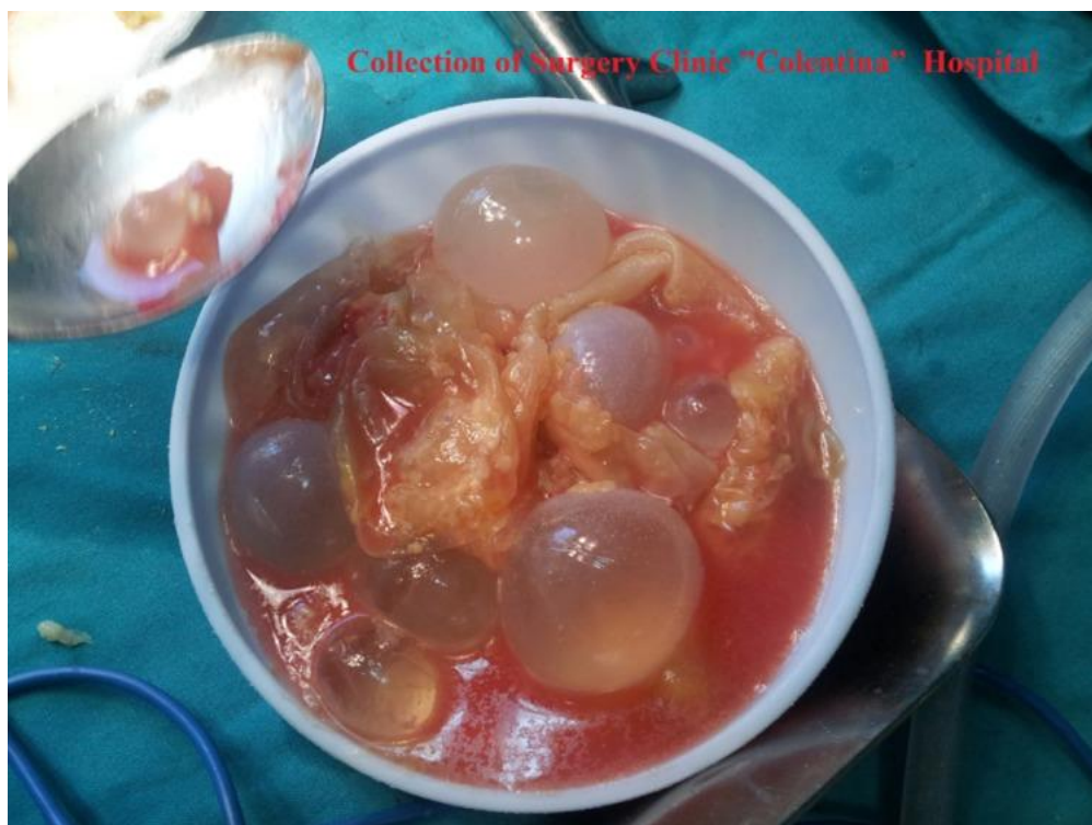
Fig. 1. Collection of surgery clinic "Colentina" hospital