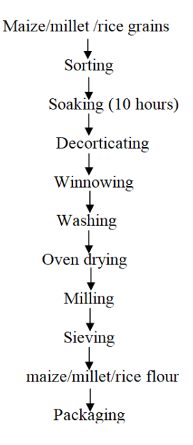
Fig.1 Flow chart for processing of maize, millet and rice flours

after sorting and cleaning were soaked for 2 hours, de-hulled manually (by lightly pounding in a mortar with a pestle), sundried slightly and the brans removed by winnowing. These were then washed, dried and toasted mildly to reduce their beany flavor and also destroy some antinutritional factors. The grains were allowed to cool and then milled in attrition mill. The flours obtained were sieved with a 300µm mesh and then packaged inside plastic buckets and covered with tight-fitting lids. This process is shown in Fig. 2.